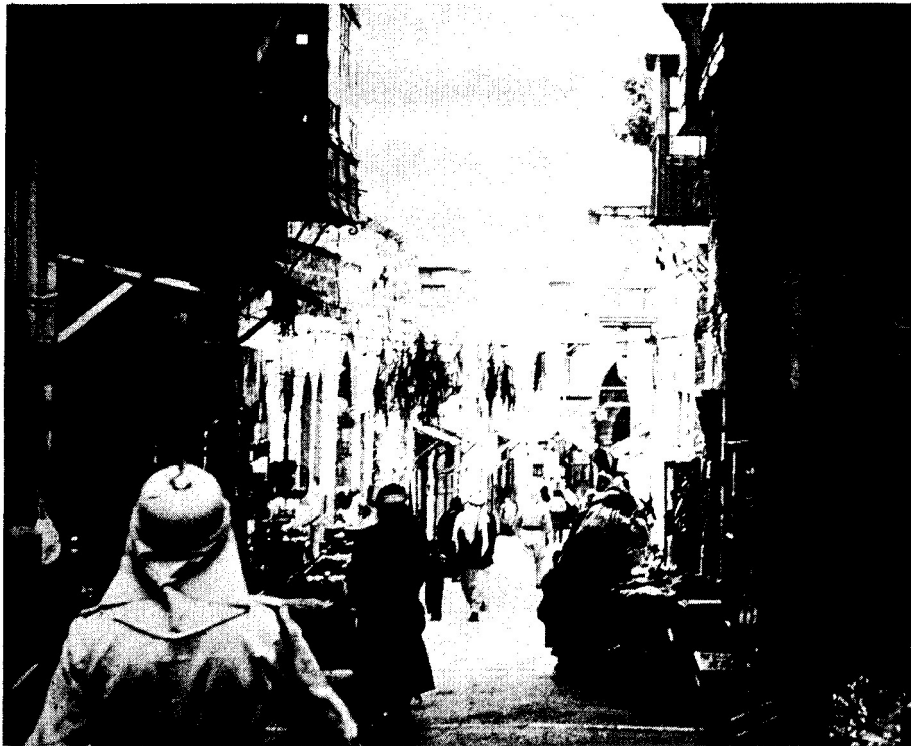
A typical street scene in the Arab Section of Old Jerusalem.

After leaving the mosque we were taken to the market, or Bazar (as they are called there). There were narrow, dirty streets packed with dirty people—all Arabs in dirty robes. There were open shops on both sides of the streets. A number of times in the crowd we were