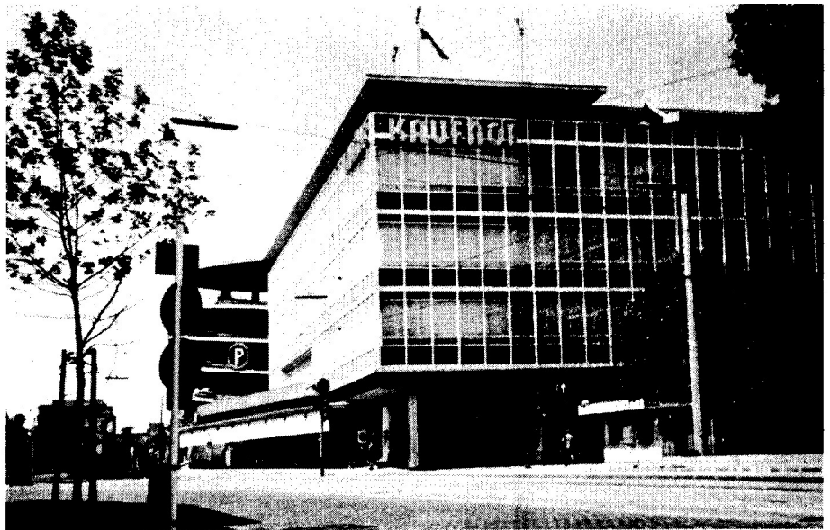
From the ruins of Köln rises this new Department Store. At left in rear, marked with the letter "P", for parking, is a modern circular ramp leading to a 5-storied indoor parking building.

But while Washington and London were promising the people all this, the WORLD TOMORROW listeners were being told that Germany WOULD rise again—that the BIBLE said that the ancient ROMAN EMPIRE would be resurrected by a UNION of TEN nations in