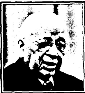
HERBERT W. ARMSTRONG

than twice the production per eight-hour day than others per nine-hour day. We pay $5 labor cost for the same production others receive for $7 labor cost—and our employees make $1.25 more per day for one hour less work."