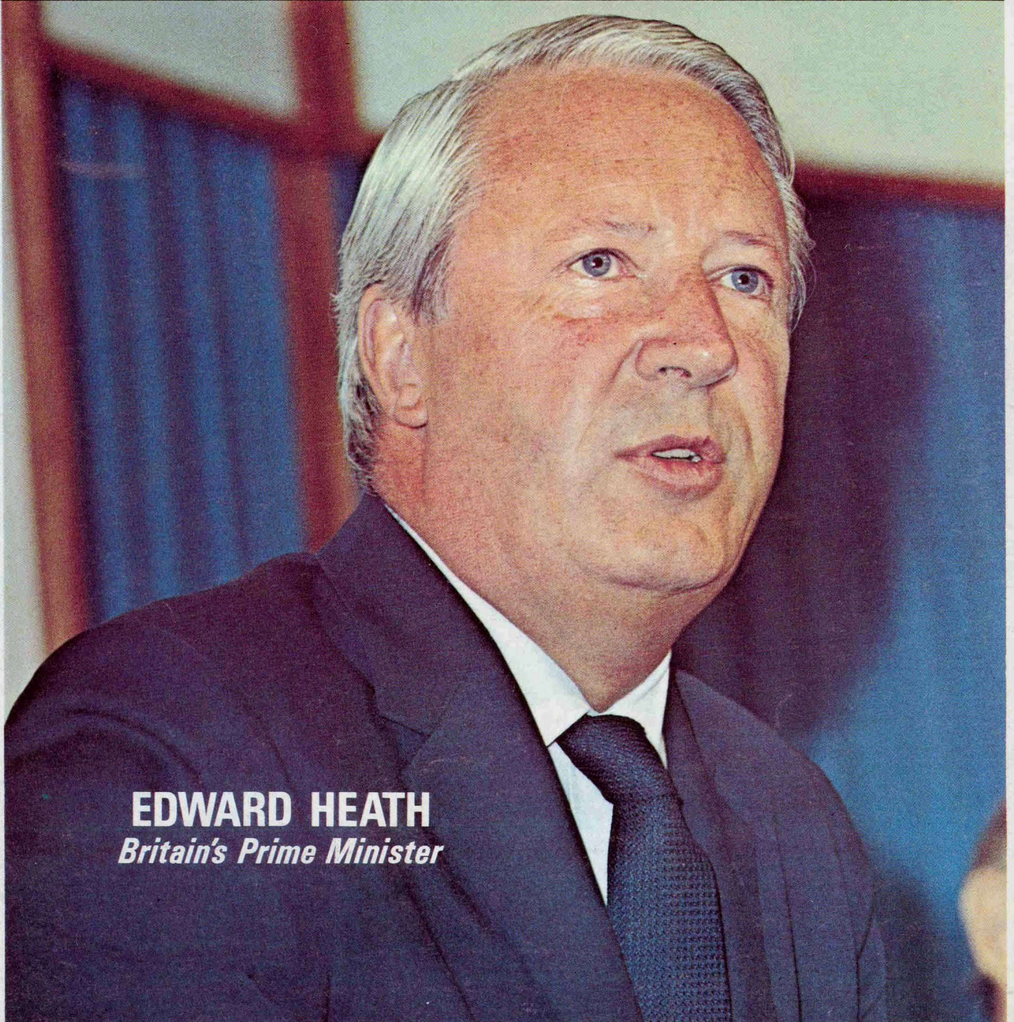
EDWARD HEATH Britain's Prime Minister