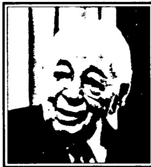
HERBERT W. ARMSTRONG

In the first place, had you checked, you would have found that these globe-girding travels obeying the Great Commission from Christ, were allocated the smallest amount on the Worldwide Church of God annual