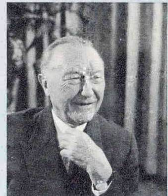
OUR COVER

Dr. Konrad Adenauer, lovingly called "Der Alte" (the Old One) by his countrymen, was honored and respected around the world. He was a man of strong personal character, temperate and patient. A politician, he was also a lover of roses. It was primarily Adenauer's dauntless statesmanship which led West Germany up from the ashes of defeat to become the free world's second greatest industrial power and the most powerful military ally of the United States.