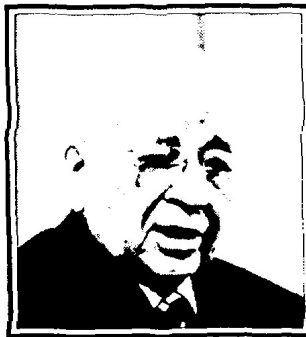
HERBERT W. ARMSTRONG

What brought a fast-advancing civilization to the very brink of such unbelievable —yet real ultimate catastrophe? Why the paradox? If the threat is too awesome for most to contemplate, so is the advancement and progress in