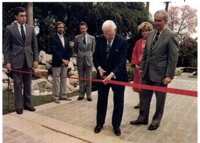
Ongoing achievement: Herbert W. Armstrong opens new mall area on Pasadena, Calif., campus of Ambassador College.

On this assignment I pioneered in making surveys, based on the law-of-average principle, sampling public opinion, attitudes, consumer buying habits, facts about life — about failure and success — about mental states of