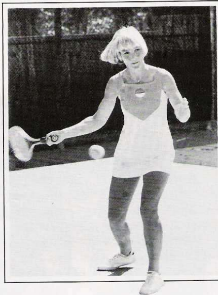
Youth 81 Photo

To some young men of high school age, a pro athlete is looked upon as the greatest of men. Another prizefighter knew this, and got into many sports-page headlines, bragging, “I am the