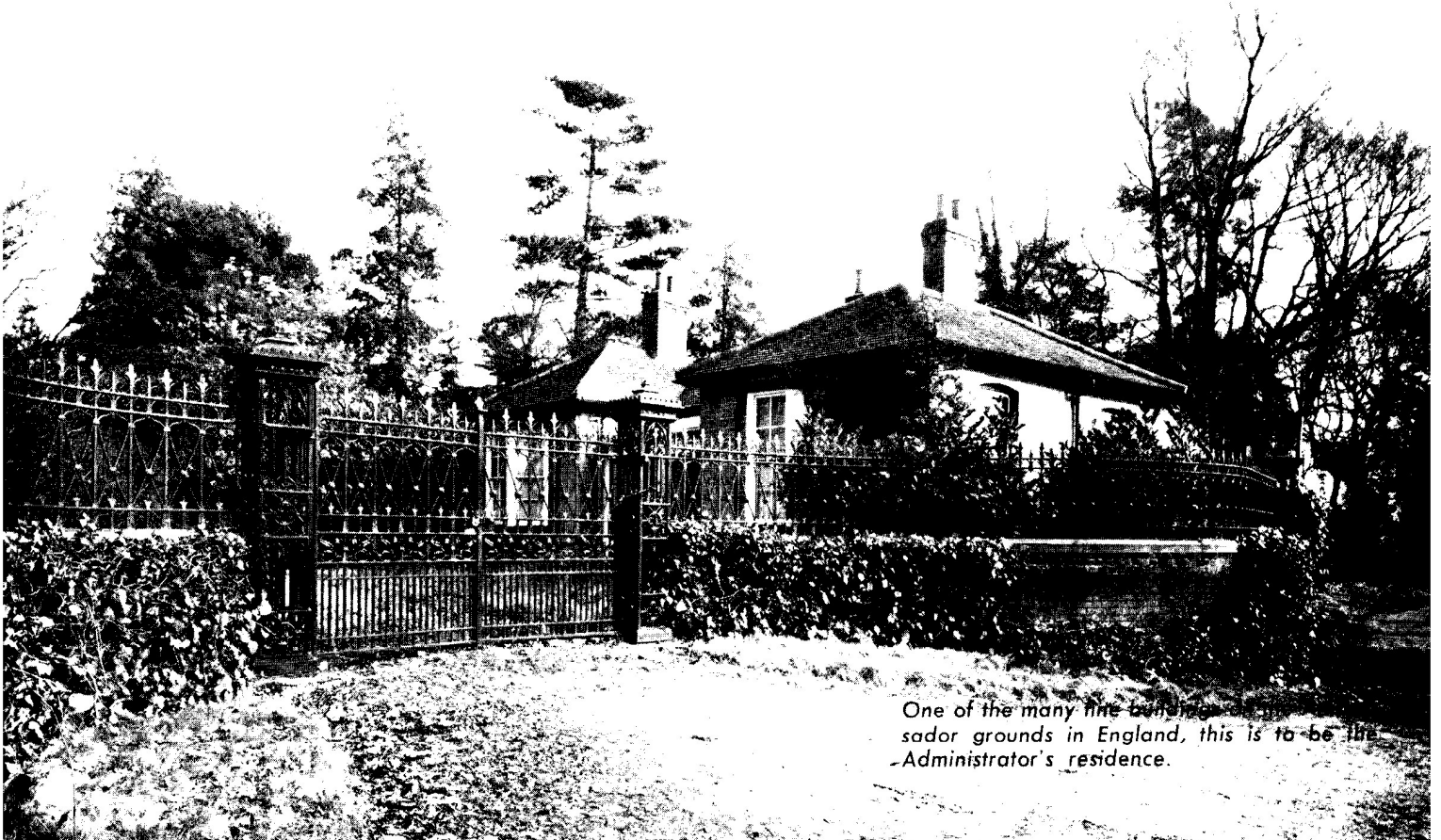
One of the many fine buildings on the Ambassador grounds in England, this is to be the Administrator's residence.