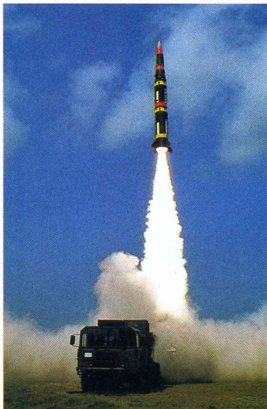
Pershing II missile launch. Worsening world troubles offer ominous portents for near future.

turbances in the sky. The Laodicean era of the Church shall rise OUT OF, through and in the latter