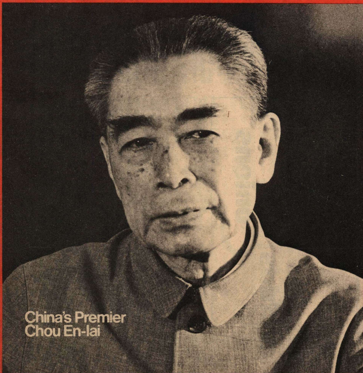
China's Premier Chou En-lai

Tough Decision for U.S. TAIPEI OR PEKING