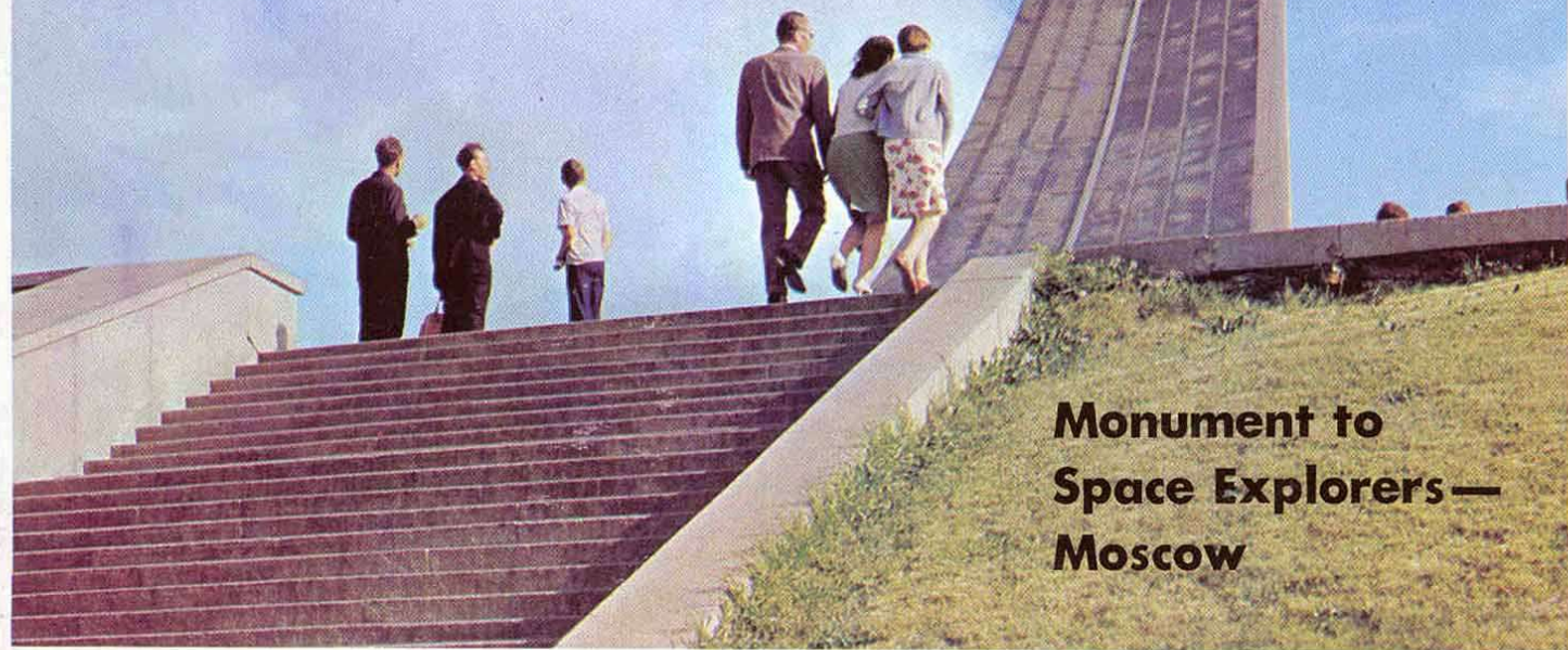
Monument to Space Explorers— Moscow