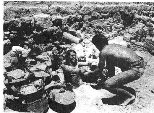
DIGGING UP HISTORY — Ambassador College students work at the archaeological excavation site on the Temple Mount in Jerusalem in the summer of 1976, the last time students participated in the dig. The college plans to send 24 students to work at the site this summer.