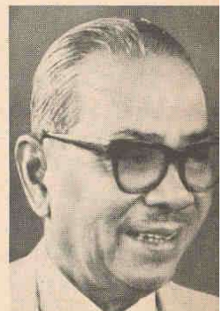
New leaders include, from left to right, Tho of South Vietnam, Prime Minister