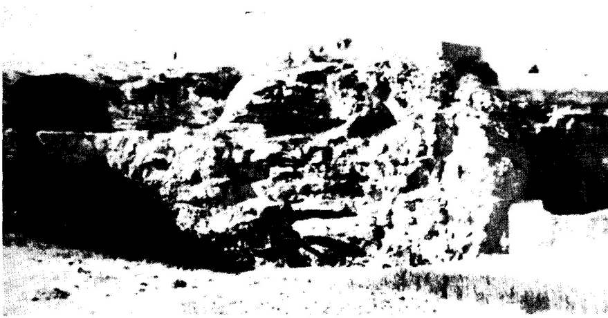
The rock above is called "Golgotha" in the Hebrew. It means "The Place of the Skull." Jesus was crucified atop this rock. Notice the natural caves forming the eyes and mouth.

From this place can be seen "The Place of the Skull." No one can fail to see the resemblance. There is a low eroded forehead, two deep hollows that make the eyes, a nose, and near the ground level, twisted lips.