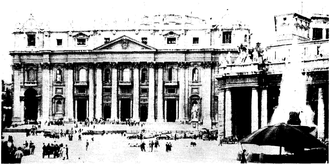
The world-famous St. Peter's Cathedral in the Vatican. Part of the Pope's Palace may be seen in the upper right corner. Note the immense statues atop the walls—compared with the visitors below.

After seeing Naples, we drove to the ruined city of Pompeii. This was the most startling place we have seen. In the year 79 A.D., Pompeii was completely covered with ashes from Mt. Vesuvius. It was a city of twenty-thousand people. While thousands escaped from the city to the sea, hundreds perished in their homes and in the streets.