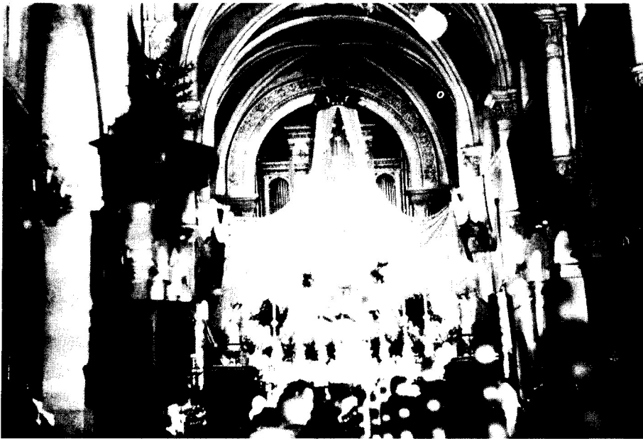
The gorgeous altar of a Palestinian Catholic Church. The Church is dedicated to Mary, who is mistakenly called "Queen of Heaven."