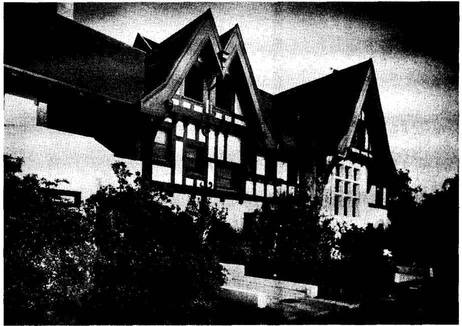
Here is a view of MAYFAIR—splendid 28-room women's dormitory.

But if a student prefers TRUE knowledge, with God's revelation as the starting point and basic concept, and the knowledge discoverable by man built truthfully on that solid foundation, with the doctrines, the truths of God and the revealed knowledge, historic and otherwise, of God, as the basic CONCEPT