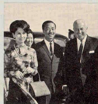
Hughes — Ambassador Photo