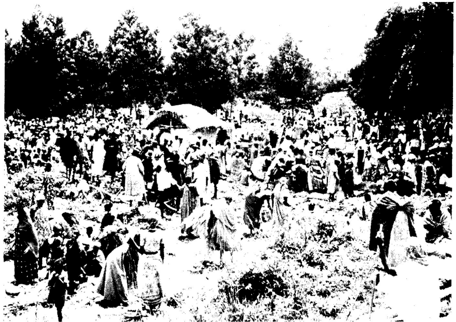
A typical native market in East Africa. Natives are better clothed than in the Congo. Markets are usually clearings cut out of the "bush." These markets are the center of native life in the country.

Copyright, December, 1957 By the Radio Church of God