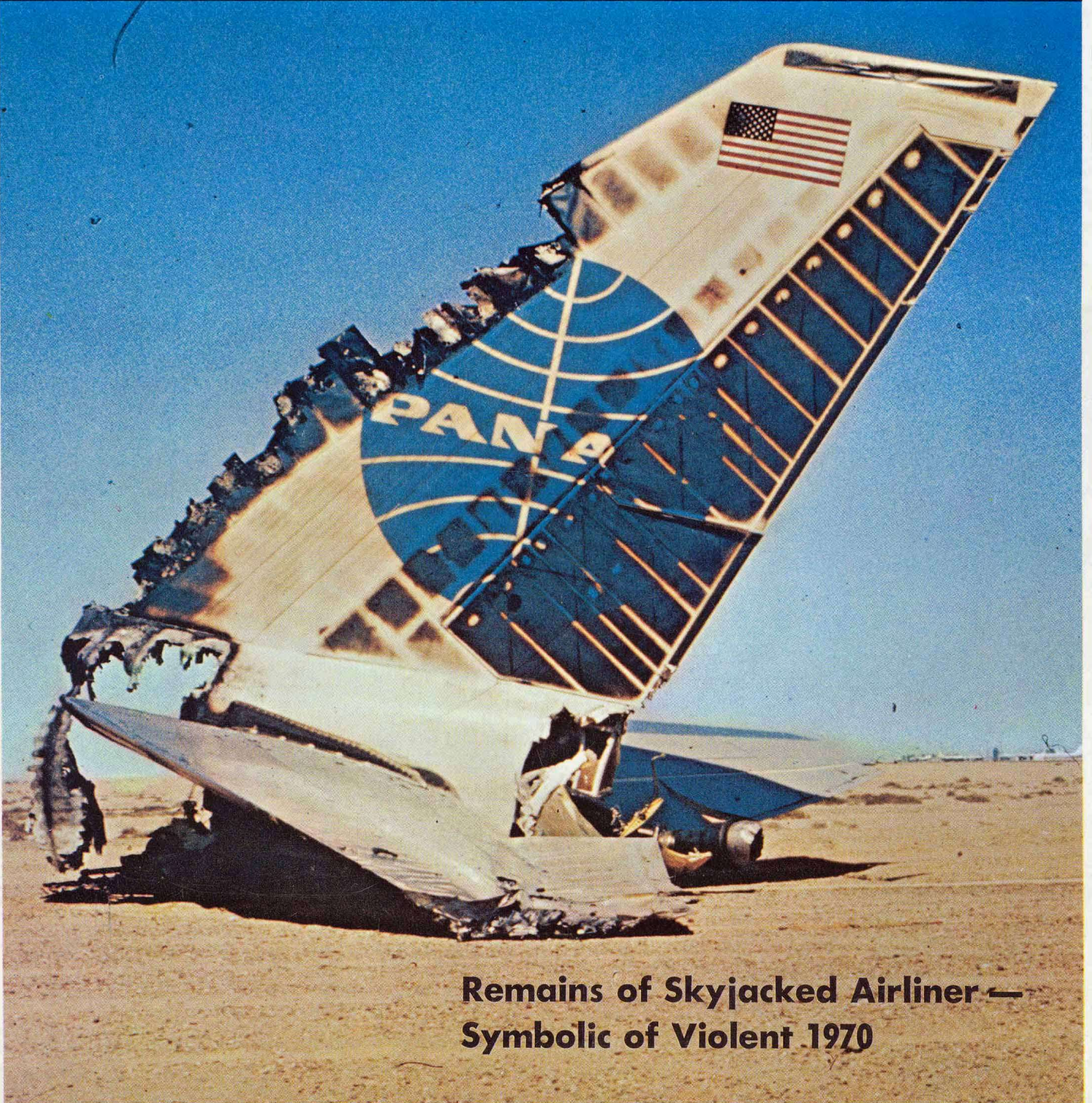
Remains of Skyjacked Airliner — Symbolic of Violent 1970