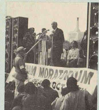
Kilburn — Ambassador College