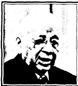
HERBERT W. ARMSTRONG

If ever a President needed the help of this great people he leads, it is now. Some are asking, can you turn the United States around? They look to problems of inflation, unemployment, energy, taxes, budget, business, defense. But those are materialistic problems. In the materialistic area we have fared better than we realize. This nation has