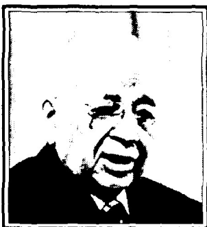
HERBERT W. ARMSTRONG

Yet we all try to simply put that awesome possibility out of mind! Do we suppose that just not thinking about it,