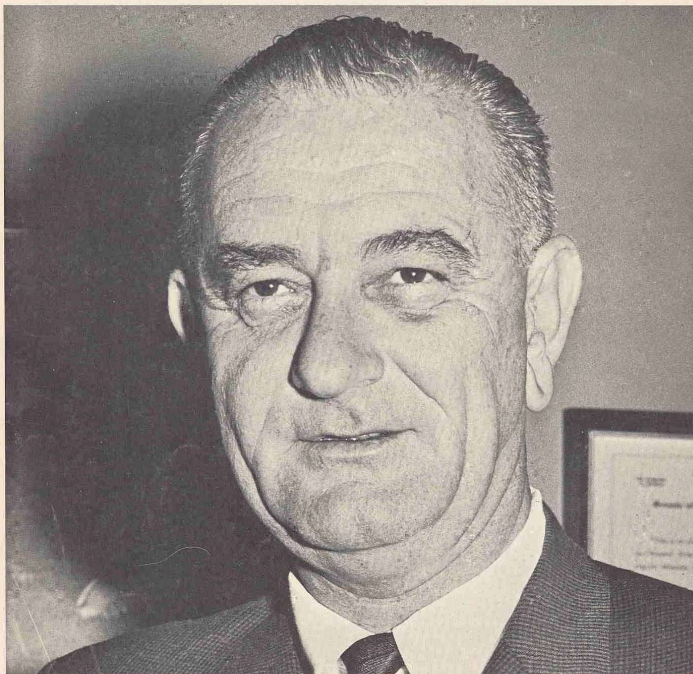
PRESIDENT LYNDON B. JOHNSON