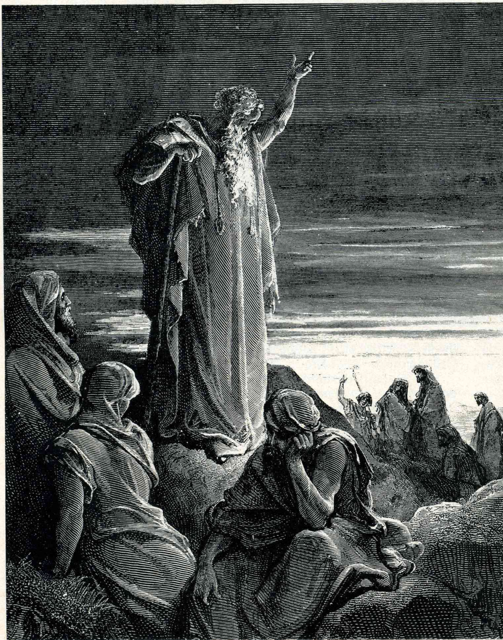
Illustration by G. Dore

God's FURY is an expression used many times in prophecies to indicate the troubles soon to strike us — great tribulation and first phase of the "day of the Lord" — which shall climax in CHRIST'S SECOND COMING!