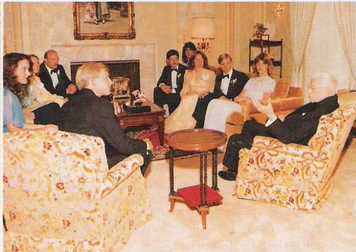
The author, soon to begin his 93rd year, meets with young people to show his interest in youth and to explain the hope we have for the future.

chasing the false values and suffering the painful consequences. People will learn the WAY to real happiness and find it. Life will be continuously interesting and invigorating. There will