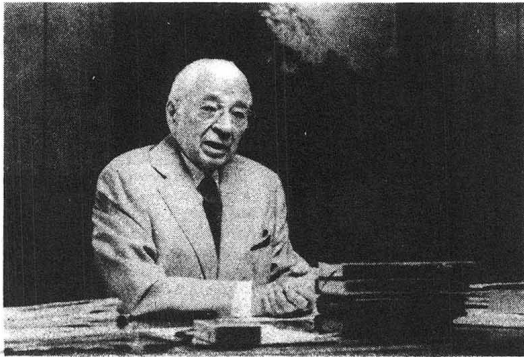
PASTOR GENERAL SPEAKS — Pastor General Herbert W. Armstrong addresses evangelists and instructors for the Ministerial Refreshing Program in his new studio/office in Tucson July 2.