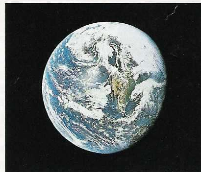
The God who created the earth also created a way of life that causes peace and happiness.

Adam and Eve rejected divine revelation, as does modern science today. They didn't believe what their Creator said! And it