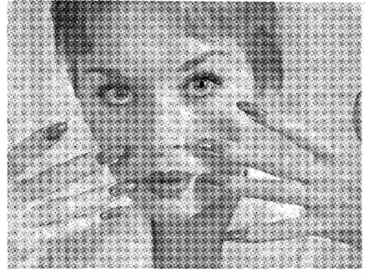
Example of a woman painting over the jewel. The true beauty comes from within and cannot be "painted on"!

hidden person (INWARD ADORNING) of the heart with the imperishable jewel of a gentle and quiet spirit, which in God's sight (but not in the sight of the world) is very precious. So once the holy women who hoped in God used to adorn themselves and were submissive to their husbands" (I Pet. 3:1, 3-5, Revised Standard Version).