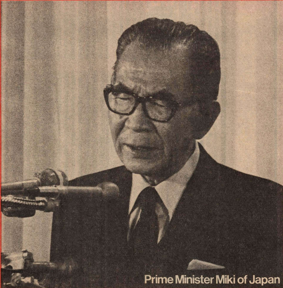
Prime Minister Miki of Japan