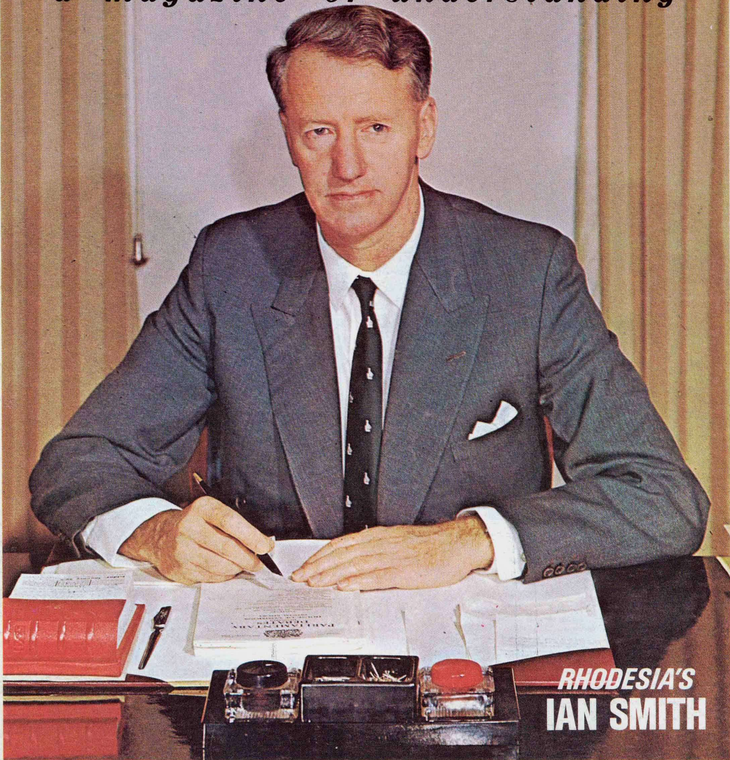
RHODESIA'S IAN SMITH