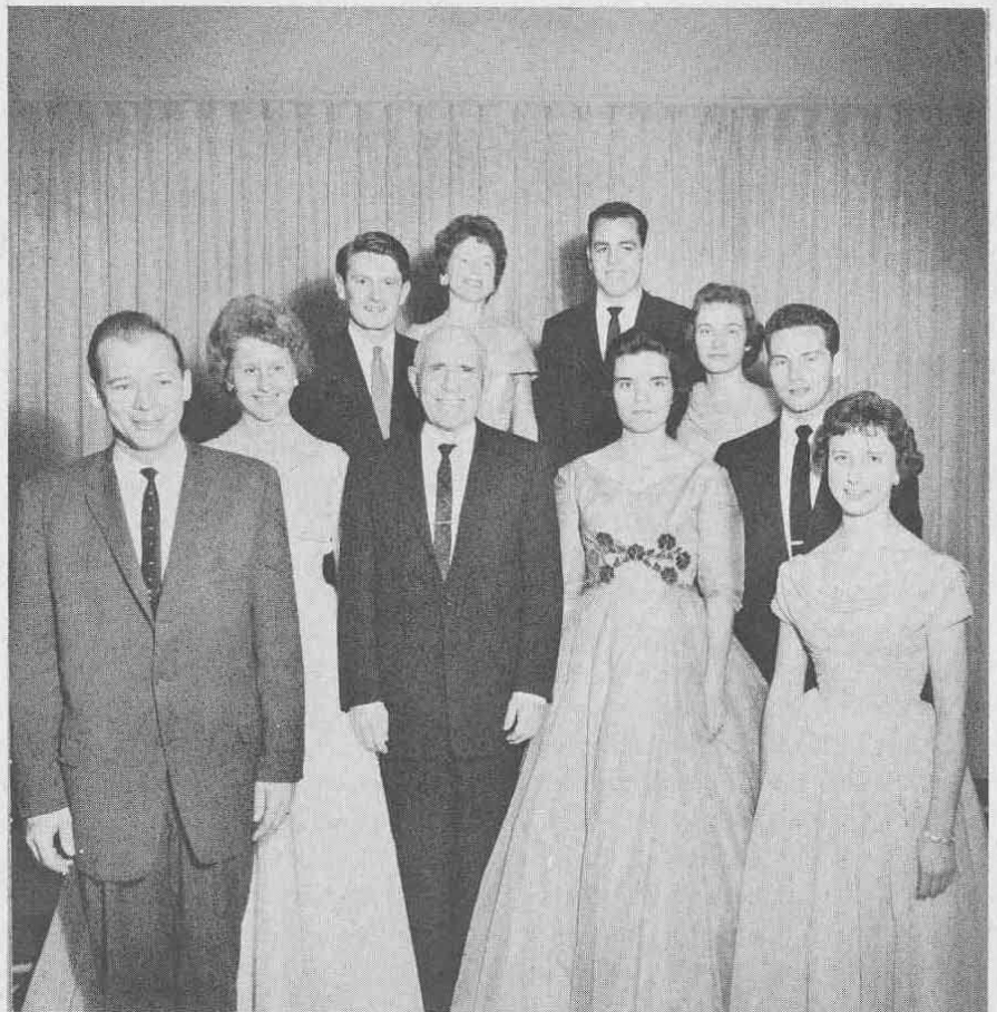
The Ambassador Octet provides cultural training for both young men and women.