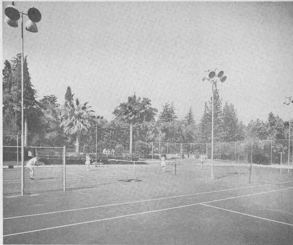
Tennis courts provide ample opportunity for physical exercise and social entertainment for Ambassador students.

Today "modern science," especially through biology, psychiatry, medicine and other so-called sciences, aided and abetted by the moral toboggan-slide, has swung the public attitude and the practise among juveniles to the opposite extreme. Today TIME magazine reports a "New Religion" in Europe from Paris—a religion of "emancipation" for women—a "religion" of unbridled immorality. Today a London newspaper in two feature articles exposes the "new freedom" in Sweden. A mother is quoted as saying she finally became a little dissatisfied finding a strange girl frequently in her kitchen in a bathrobe on arising of a morning; and, since her 20-year-old