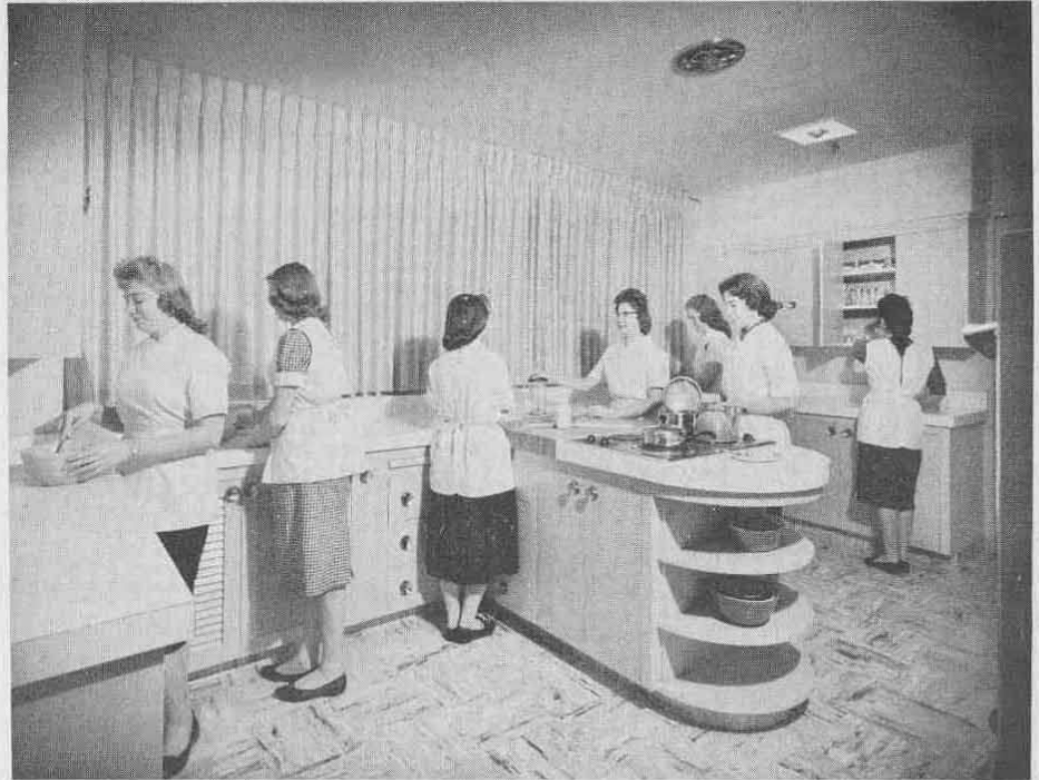
The Home Economics Department at Ambassador College, Pasadena, California, provides young women with ample facilities and training.

The Academy founded by Plato, some 350 years before Christ, gave instruction to men only. The pagan schools that dotted the Roman Empire in the first centuries after Christ were for men only. The Cathedral and the Monastic schools which replaced them after the 6th century admitted no women. The first universities at Salerno and Paris were attended only by men. When Oxford, Cambridge, Harvard, Yale and Columbia first were formed—and for some