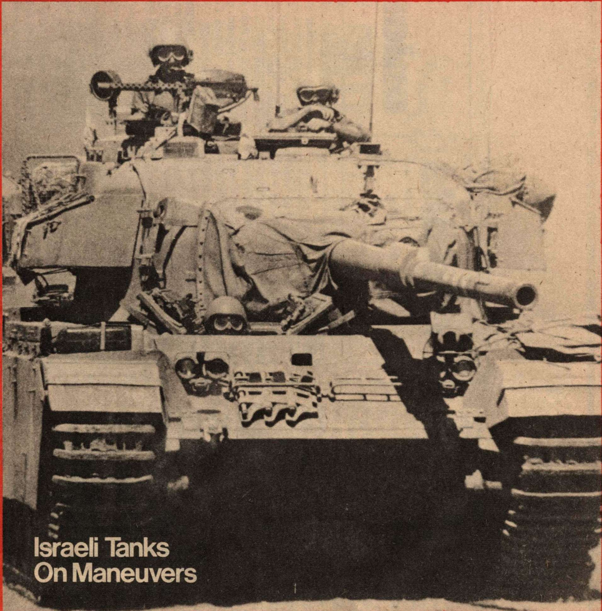
Israeli Tanks On Maneuvers