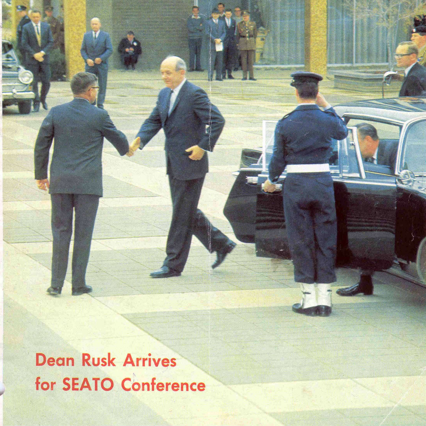
Dean Rusk Arrives for SEATO Conference