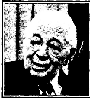
1980, writing in the Washington Star, described it this way:

Pogrom, however, may be the only word suitable for describing the ghastly attack on our Church by the attorney general. Conservative columnist James J. Kilpatrick, on March 25,