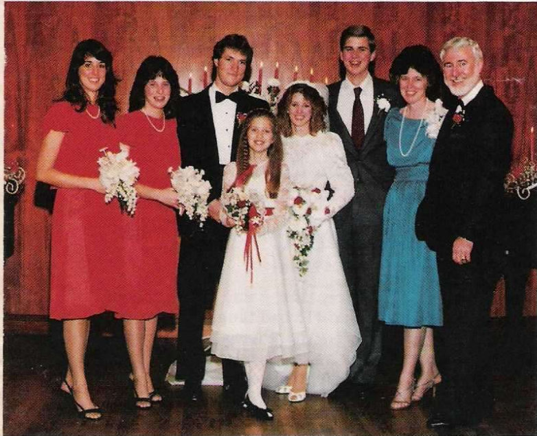
Of all of God's creations, humanity alone was created for the God-plane relationships of marriage and family life.

man leave his father and his mother, and shall cleave unto his wife" (Genesis 2:24).