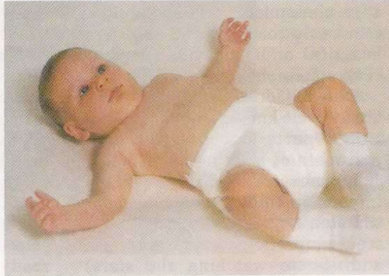
Human babies are born helpless. They need tender care, patient training and love from their parents.

Inanimate objects have no mind, make no decisions, have no character. Animals have instinct installed in brains . But animals do not possess human-level consciousness of self, do not absorb knowledge from which they reason, make choice and will to act even to enforcing self-discipline.