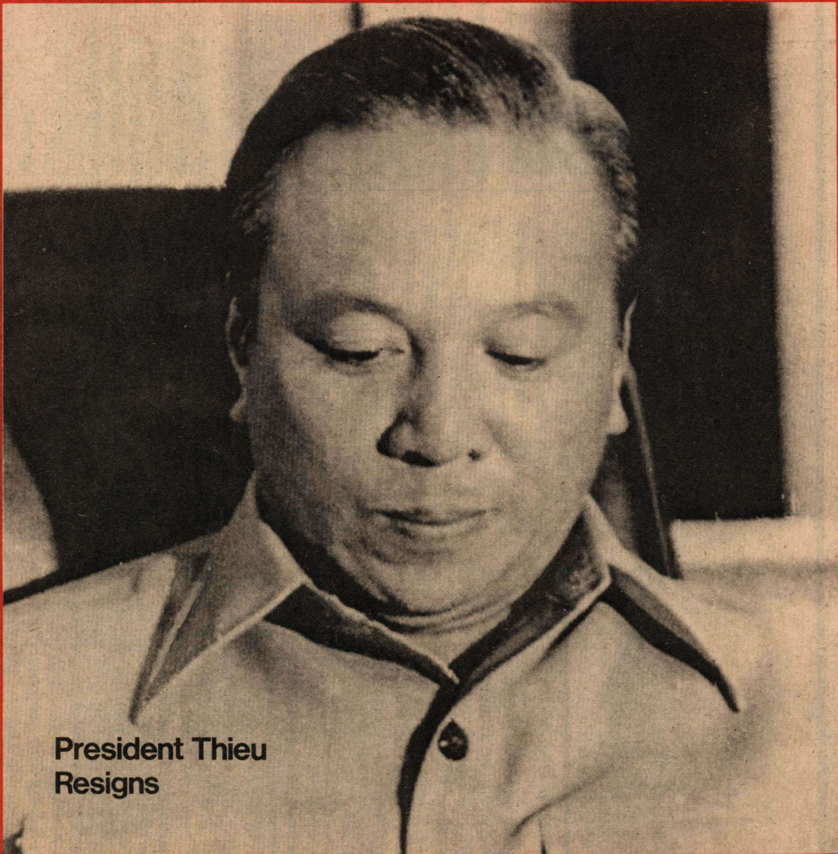
President Thieu Resigns