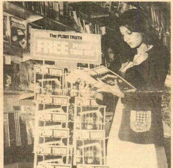
'PLAIN TRUTH' NEWSSTAND — A reader examines a copy of The Plain Truth at a newsstand in a bookstore. Herbert W. Armstrong discusses the future of The Plain Truth and expansion of newsstand circulation in the accompanying article on this page.

This basic program was supplemented by monthly co-worker letters from me, semi-annual letters to PT subscribers and a