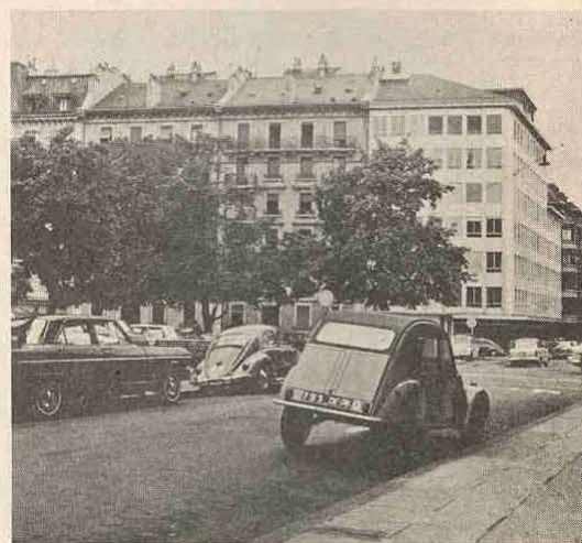
Above, downtown Geneva today, with new office for the French version of The World Tomorrow located in the white building at the right, fourth floor.