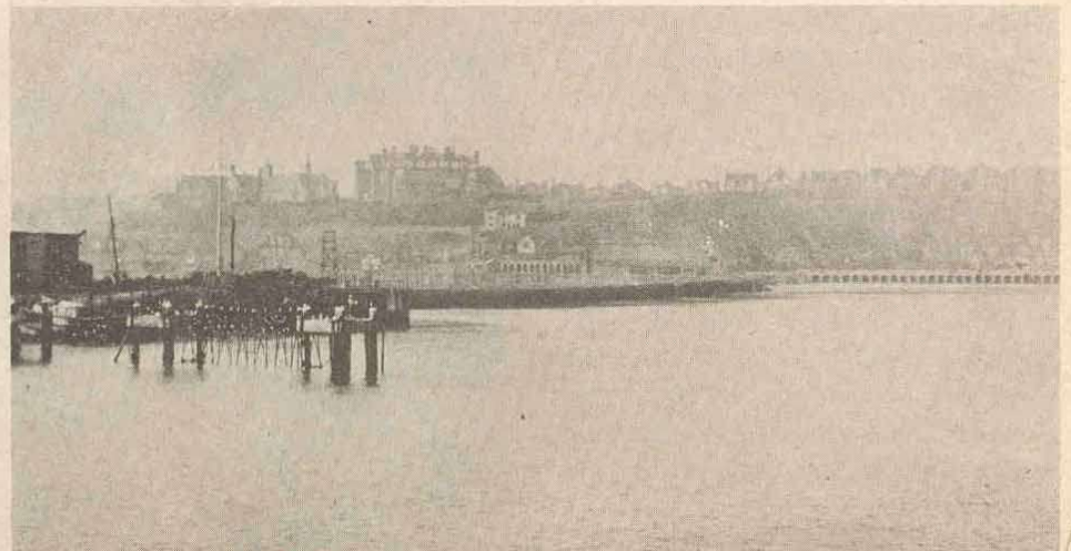
Approaching Dover, England, during return Channel crossing.

Arriving back in London, I found letters and reports from the office in