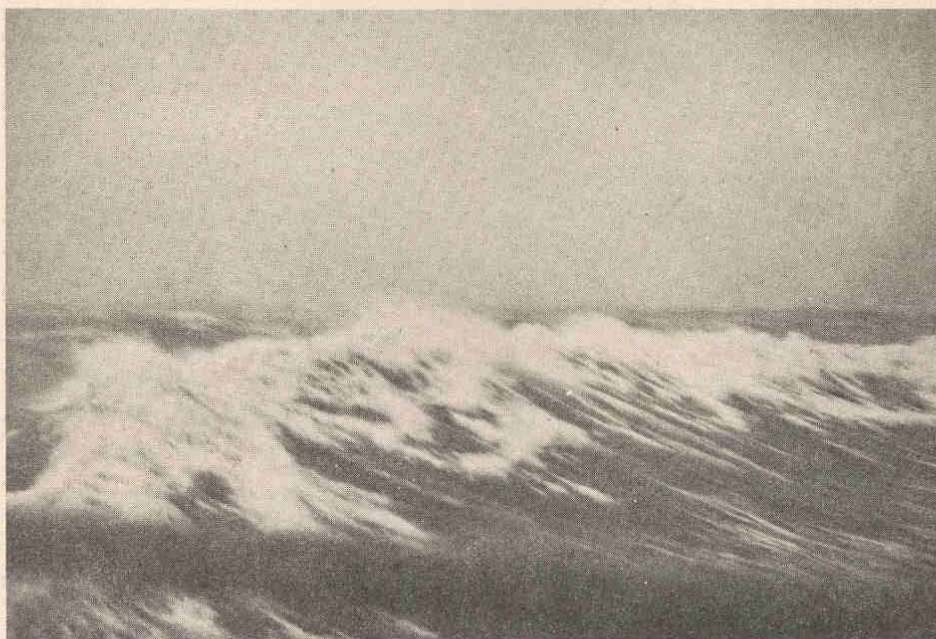
Towering 60-foot waves in the hurricane in Mid-Atlantic.

But the worst was yet to come—and I had not realized, when the above was written, that we were in a hurricane! Actually I did not realize how serious the storm was until we docked in New York, as I shall explain below. But the storm became more wild toward evening. Early next morning I added a postscript to the above letter. Here are excerpts from it: