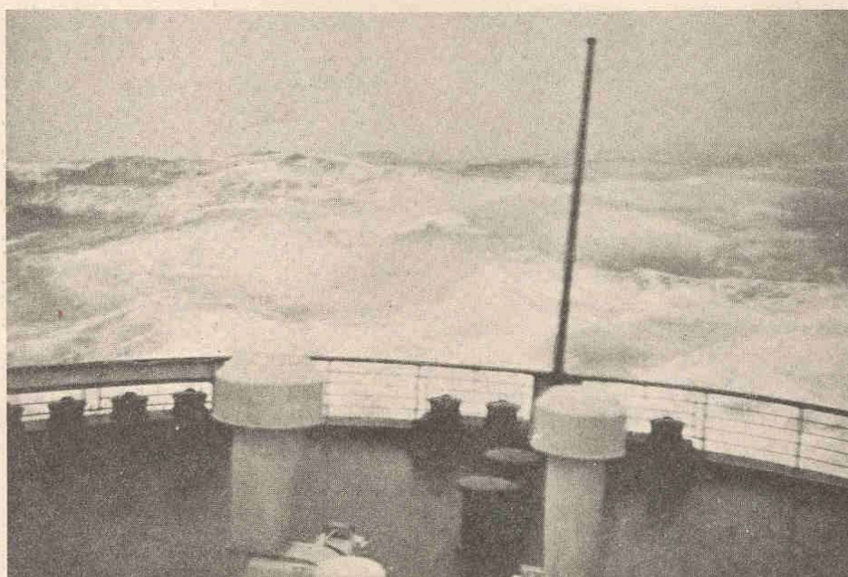
Looking down upon lower deck, which is completely submerged in raging waters.