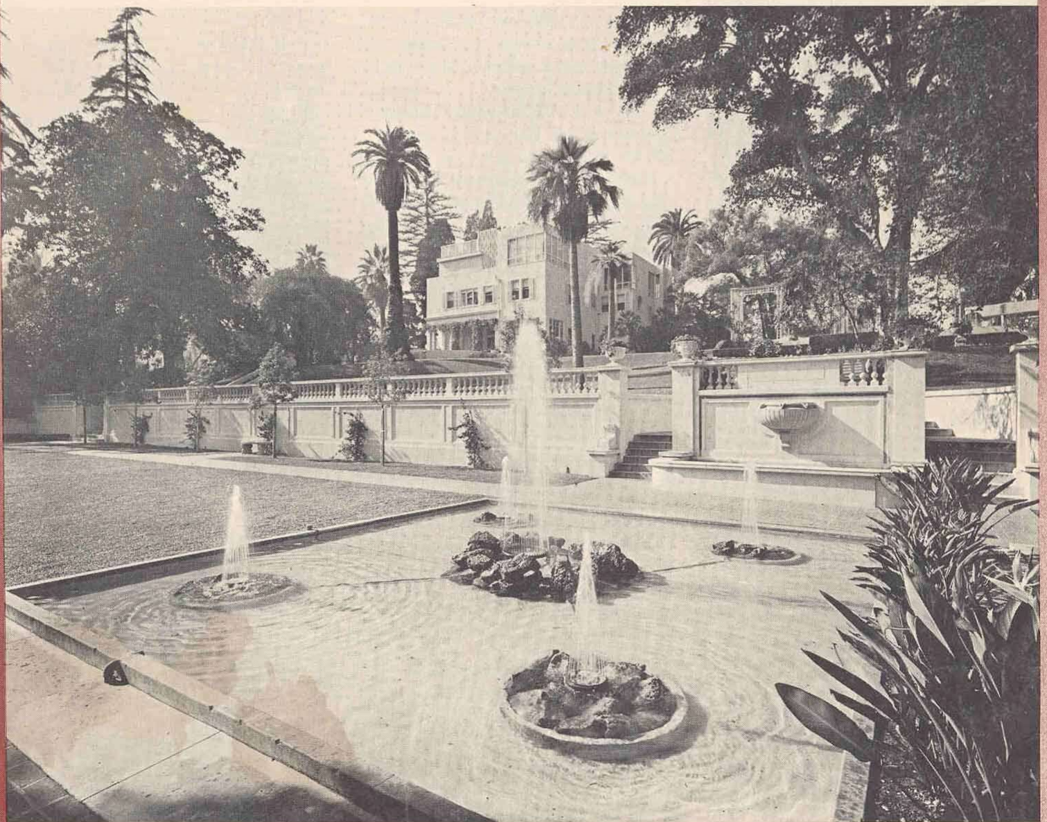
Ambassador College, Pasadena, California, with Library building framed between graceful palms. In foreground, below contoured lawns, is the beautiful Lower Garden with pool and fountains.