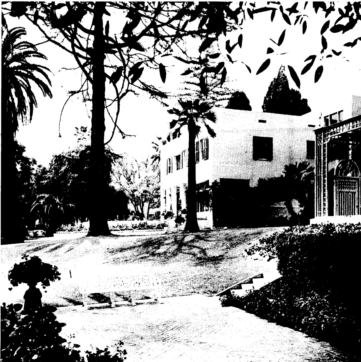
One of four patios on our picturesque AMBASSADOR COLLEGE campus