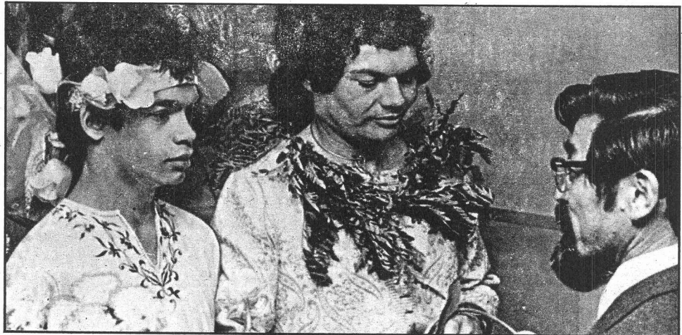
HOMOSEXUAL men are married in San Francisco's Glide Memorial Methodist Church.

The growing mountain of evidence — ranging from the Paraíba stone, the Bat Creek stone, the Metcalf stone, ancient Indian rituals, pre-Columbian terra cotta pottery to the cultural parallels, the literature of the classical world, and ancient maps — points convincingly to the conclusion that ancient mariners of the Middle East and the Orient navigated the oceans many times, establishing contact with the New World millennia before Christopher Columbus did so in 1492. Indeed, who in the face of the amazing new evidence coming to light can deny that in actual fact Columbus was a relative late comer to the New World? □