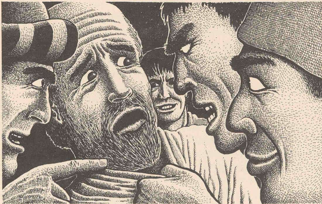
The sinister group of depraved men demanded that the old man send out his Levite guest to them.

menacingly. "Send him out here at once to us, or you'll be in for plenty of trouble! And don't tell him anything! Just get him out here!"