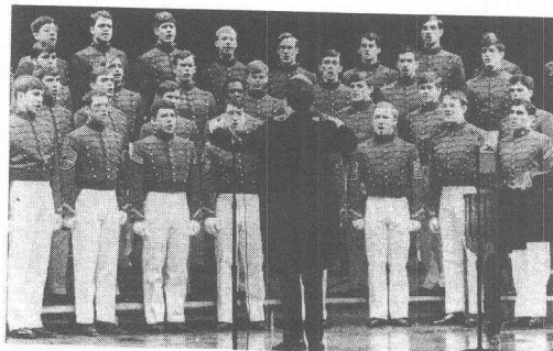
SINGING SOLDIERS — Members of the West Point Glee Club from the United States Military Academy perform in the Ambassador Auditorium. The March 19 performance was part of their West Coast tour, during which time the cadets were the guests of Ambassador College.