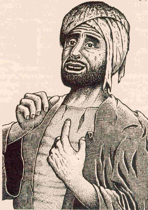
Standing before David, the stranger boldly and almost proudly announced that he was the one who had killed Saul.