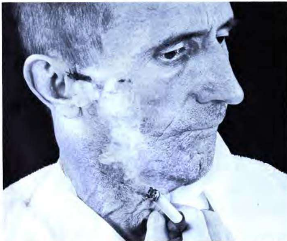
Roswell Park Memorial Institute

Compare with Revelation 17. Here is pictured a church. Not a small church