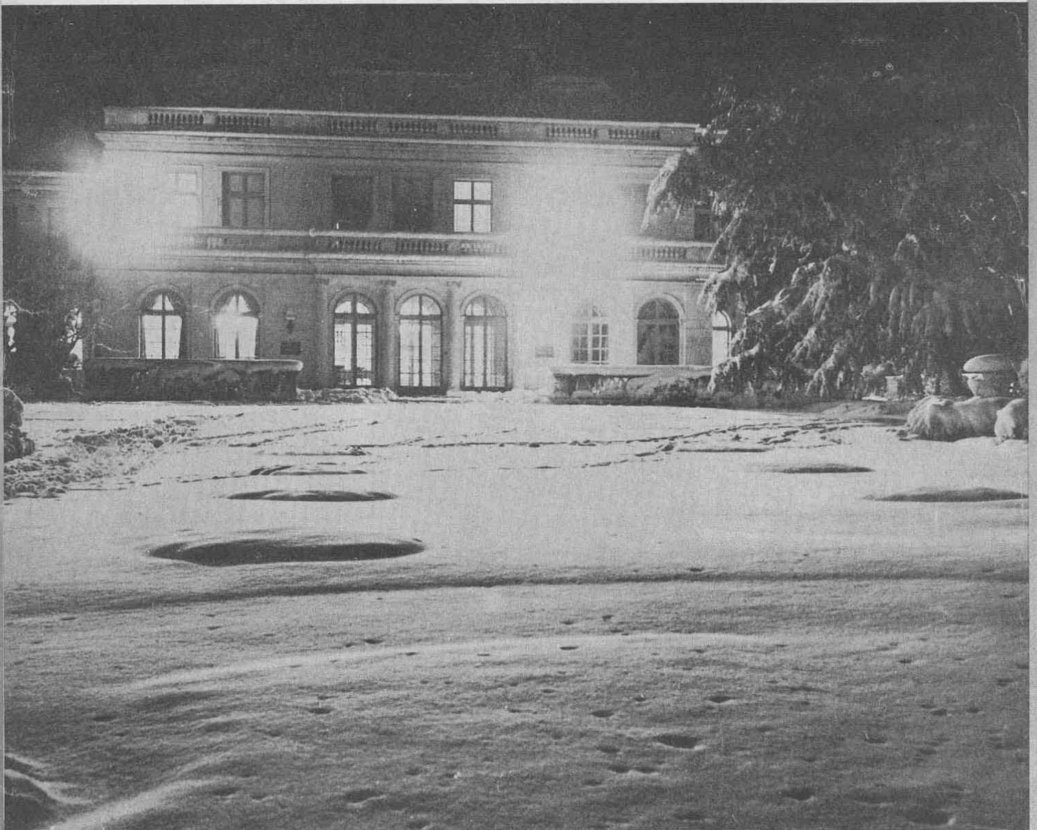
WINTER SNOWS on the Ambassador College grounds near London. Memorial Hall is lit up in the background and, to the right, one of several beautiful cedars of Lebanon tinted with snow.