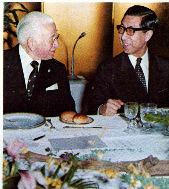
A CLOSE-UP of Prince Mikasa and Herbert W. Armstrong.

And God “shall send Jesus Christ... whom the heaven must receive until the times of restitution of all things” (Acts 3:20). Christ will soon return, in the supreme power and glory of the great God, and the kingdoms of this world will become the kingdoms of our Lord, and of