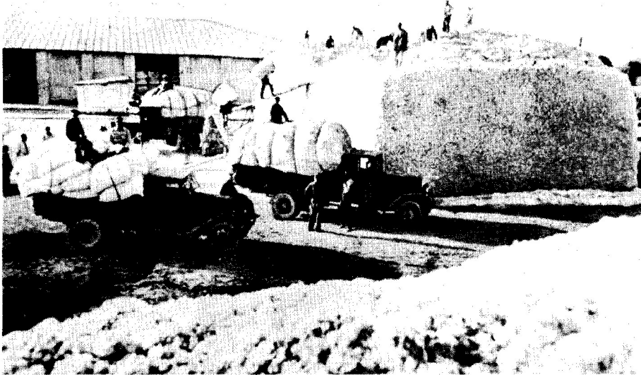
This is Russian agriculture! These two rural scenes show storage of cotton harvest at the Kurgan-Tyube delivery station (above) and threshing grain at Kyzyl-Tu collective farm. Russian farming methods are extremely backward; farmers resent being forced to give up privately owned farms.

Notice, now, the story-flow—the time-sequence! The prophet has carried us thru the sins of Israel, the coming invasion and captivity and dispersion, the Coming of Christ as DELIVERER to RE- (Please continue on page 18)