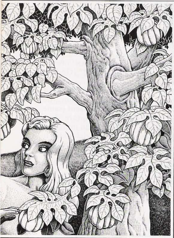
Satan lied to Eve, discrediting God's instructions. Satan's influence led Adam and Eve to take the forbidden fruit, and to feel ashamed of their physical bodies that God said were “very good.”

Yes, WHO put the sense of (Continued on page 16)