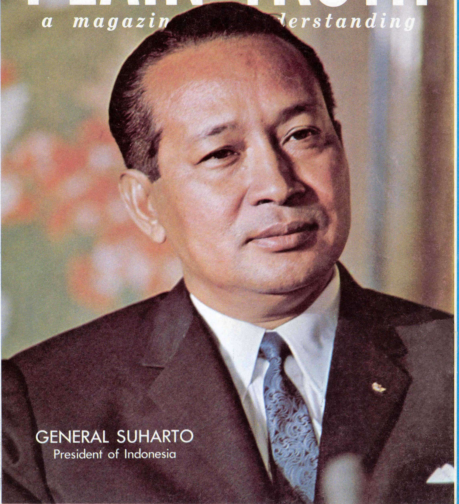
GENERAL SUHARTO President of Indonesia