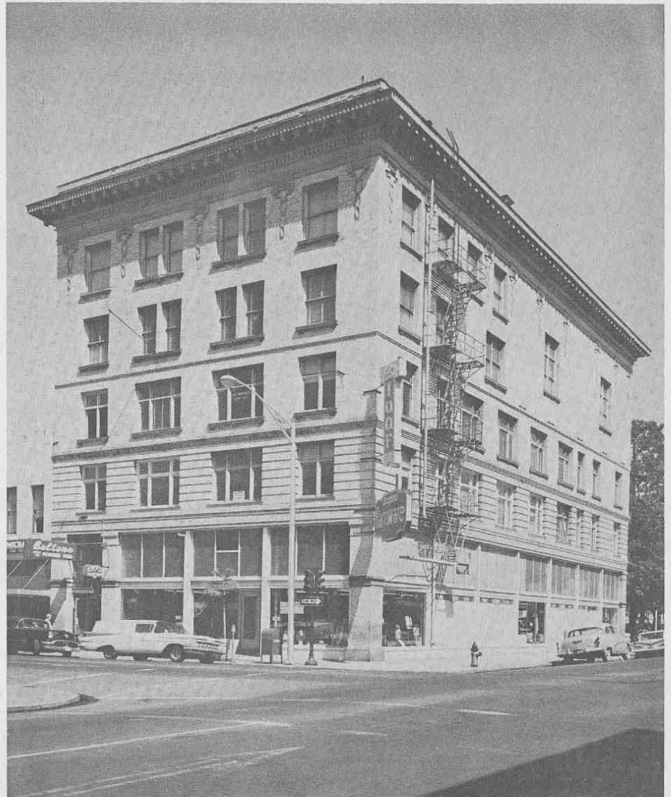
The IOOF Building in Eugene, Oregon, provided office for The WORLD TOMORROW on third floor. Move from this building was to the Ambassador College campus in Pasadena, California.

For seven years we had struggled to build this work from nothing to its 1941 size, without equipment. We had paid $5 per month rent for this small inside room. It was without windows, without ventilation, except for two transoms. One transom opened into the hall-way. The other opened into a large adjoining room where labor union meetings were held. The only ventilation we received through this